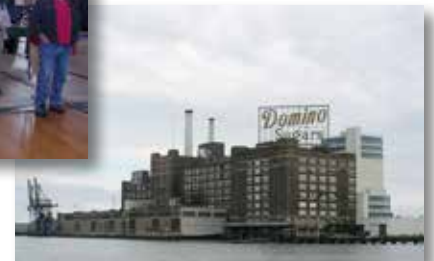
View from the Baltimore Museum of Industry,