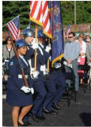
Coatesville High School Air Force Jr. ROTC present the colors.