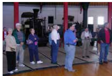
Part of the group on our guided