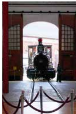
A newly restored locomotive rejoining the collection.