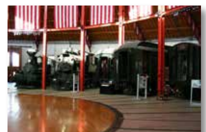
Roundhouse at the B&O Railroad Museum.