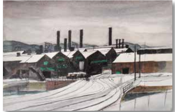
Lukens Steel, 7/7/86

The Graystone Society is seeking support to preserve and display this collection, as it relates quite directly with the National Iron and Steel Heritage Museum's mission of interpreting American industrial history.