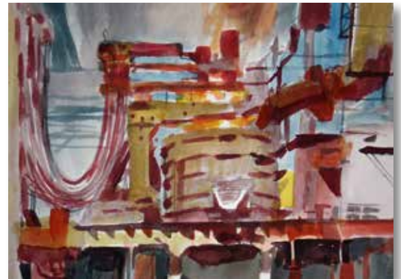
Lukens Electric Furnace